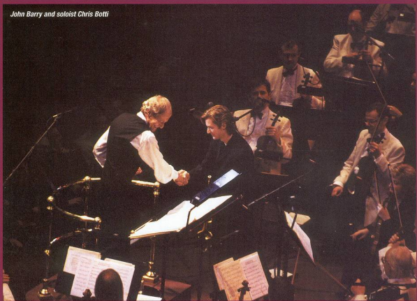
John Barry and soloist Chris Botti